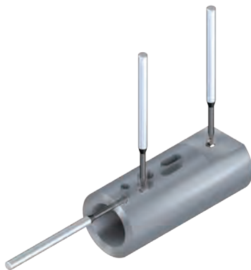
Deburring after drilling