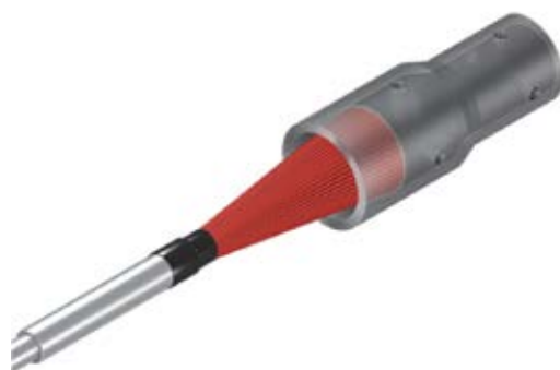
Deburring after drilling Cutter mark removal and polishing on inner diameter