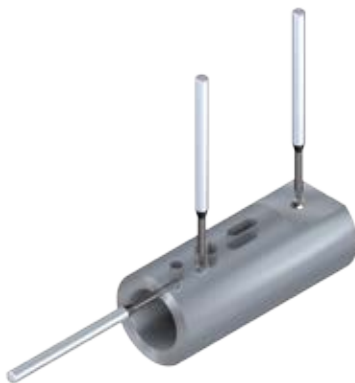
Deburring after drilling